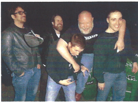
Kela * Nehpets * Egap * Divad * Wehttam

ThrAsheville: What were the early days of the band like? What was the band's initial ideal and has it changed over the years?